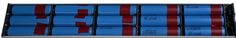
F-POD Lithium Pack and container